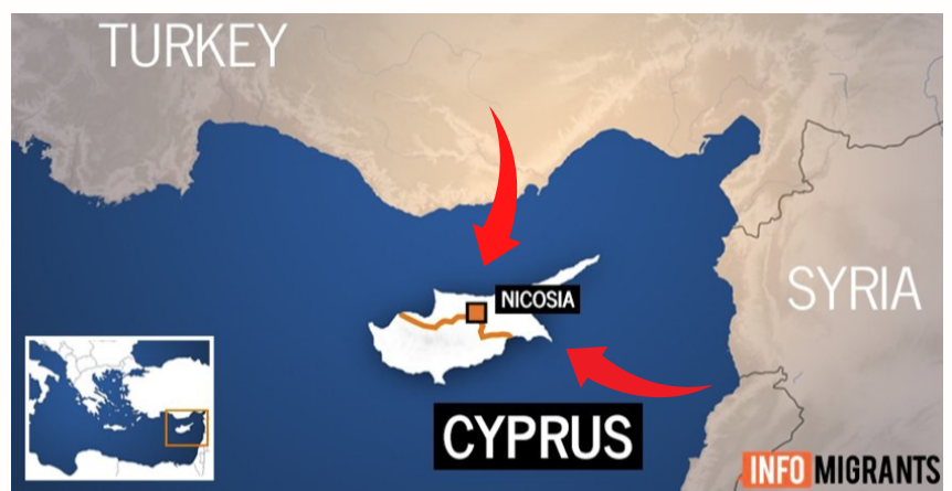
Figure 1: The migration routes towards Cyprus

The two territories are divided by a buffer zone known as the “Green Line”, an area under control of the UN which in March 2021 has been reinforced by the Cypriot administration with a barbed wire fence attempting to cut the illegal migration flow from the Northern territories.