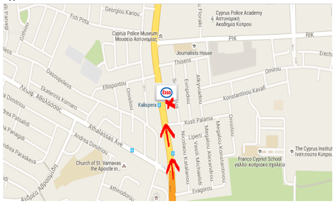
The map shows Limassol Avenue and "Esso", the petrol and diesel service station which is next to HFC's offices